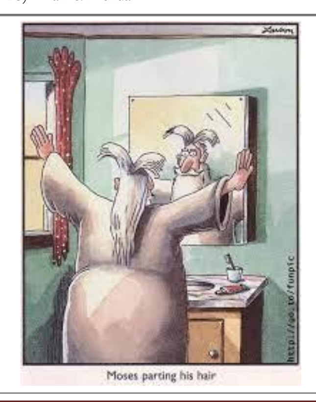
The Weathervane, September 2022

We have Hannaford shopping cards available for purchase in denominations of $100 and $50. Every $100 you purchase means RVCC gets $5. You buy the card for $100, you buy $100 worth of groceries and RVCC gets $5!!! How great is that? I am available to get cards to you. Just send me an e-mail (bolsen001@maine.rr.com) or give me a call (207-838-0123). Thanks! Brenda